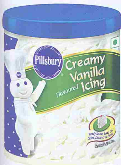
Chart out summer vacation which is packed with fun, relaxation and bonding with your kids. Keeping aside regular dance, music, art & craft classes, now you and your children can indulge in the joy of baking together at home with Pillsbury's Cooker Cake mix. A pure vegetarian cake

mix is available in Chocolate and Vanilla flavour for just ₹ 65 for a 175 gram pack and Pillsbury Chocolate Icing is also available in 2 flavours; chocolate and Vanilla in 250 grams for ₹ 80. Both the packs are available across all the major metros cities.